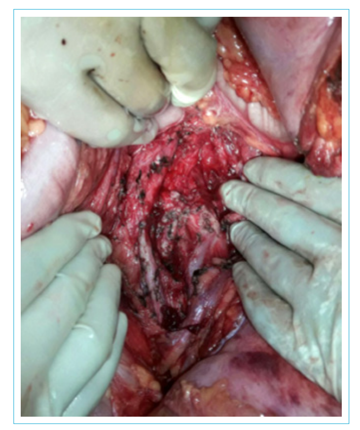
Figure 2. Intraoperative picture after excision.

Patient was readmitted after a week due to fresh eruptions of skin all over body. He was managed using intravenous steroids. He improved within 72 hours. He was discharged after 7 days on tapering regime of steroid. At follow up of one month, he was symptom free from cutaneous lesions.