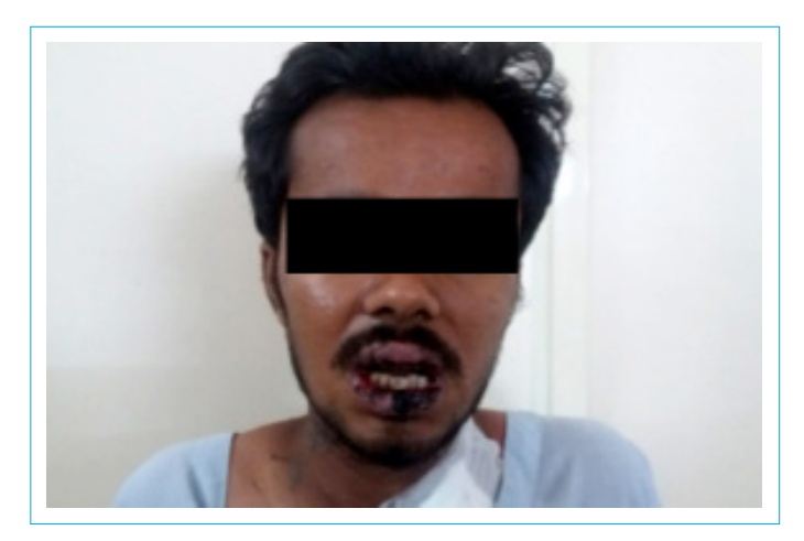
Figure 1. Mucocutaneous lesions.

Patient was kept in ICU for two postoperative days. He had uneventful recovery in post-operative period and discharged on post-operative day seven. In consultation with Dermatologist, he was kept on oral steroids. Final histopathology report diagnosed hyaline variety of castleman's disease (Fig. 3).